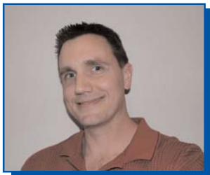
Optimal Health Concepts, CA