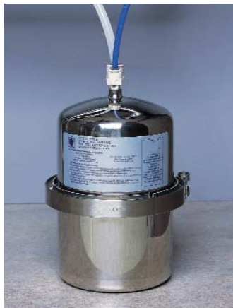
MP750SB Below Sink Unit