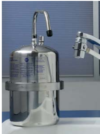
MP750SC Countertop Unit