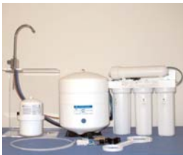
Multi-Pure Model MP750 Plus RO Suggested Retail Price: $629.95

Multi-Pure's innovative, highly effective MP750 Plus RO Drinking Water System gives you peace of mind by letting you control the quality of water you drink. By combining its highly acclaimed solid carbon block filtration technology with the reverse osmosis technology, the MP750 Plus RO System will treat the widest range of contaminants of aesthetic and health concern possible.